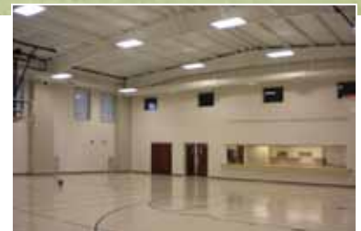
The newly constructed multipurpose building for Emmanuel Baptist Church.