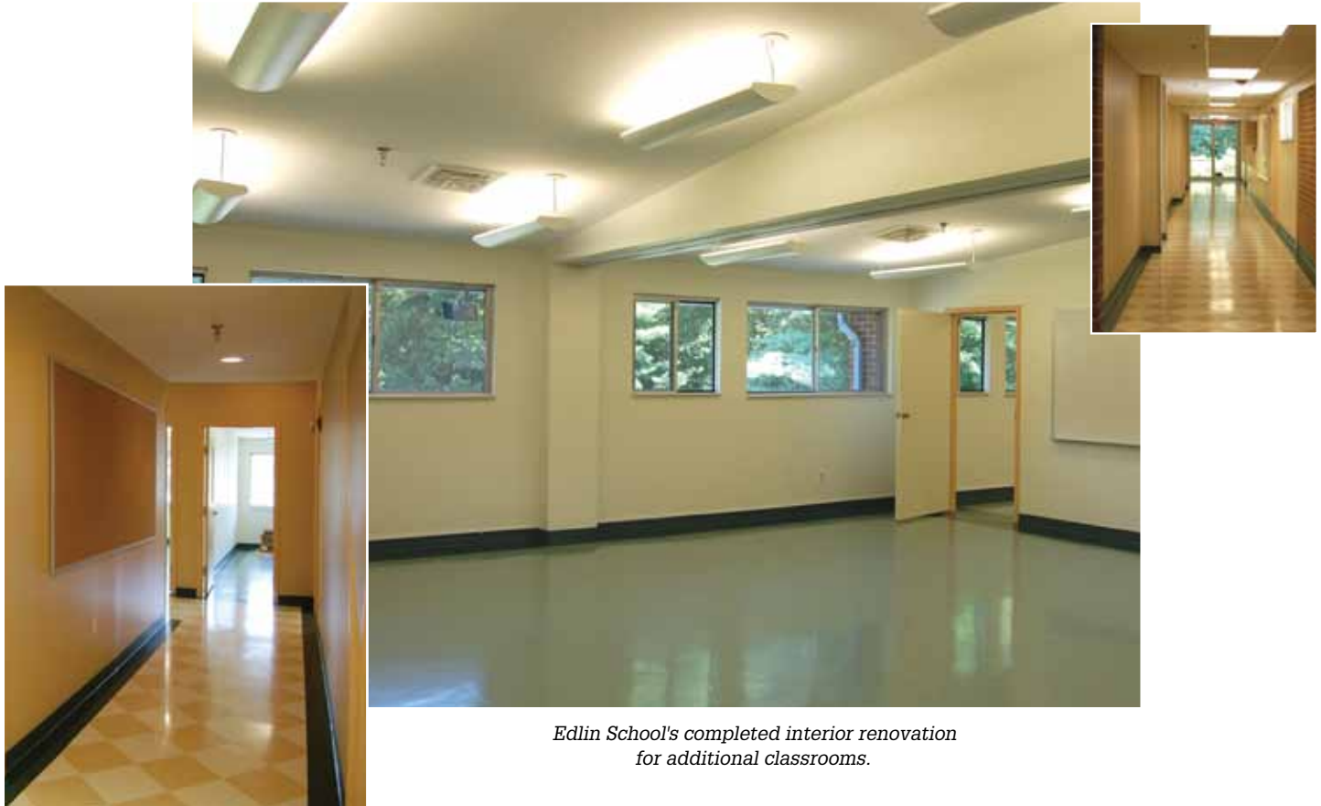
Edlin School's completed interior renovation for additional classrooms.

compartments), flooring, paint and some exterior work due to the removal/addition of exterior doorways and windows. This project was a success with the seamless transition in finishes and color from the existing to the new classroom space. Miller Brothers delivered the project on time, for the start of the school year, and on budget to the owner.